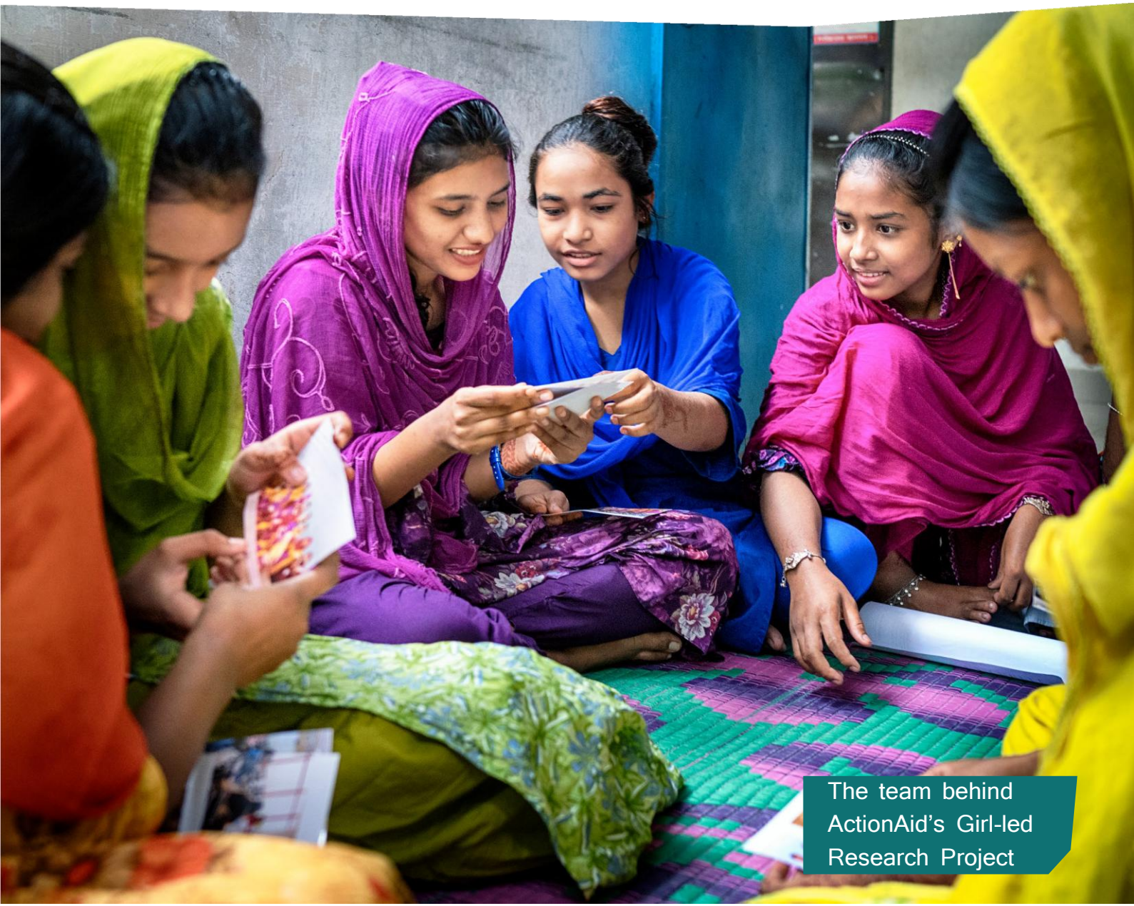
The team behind ActionAid's Girl-led Research Project

While a lot of ActionAid UK's work is supporting the Federation's humanitarian and development work through raising much needed funding, this isn't the whole story. We also tackle the root causes of global inequality and injustice by influencing UK Government commitments and policies on a range of interlinked issues including climate justice, decent and dignified work, fair public services, peace and security and an end to violence against women and girls. For more information, please find our latest annual report here .