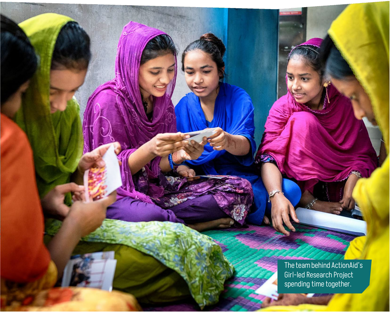
The team behind ActionAid's Girl-led Research Project spending time together.

While a lot of ActionAid UK's work is supporting the Federation's humanitarian and development work through raising much needed funding, this isn't the whole story. We also tackle the root causes of global inequality and injustice by influencing UK Government commitments and policies on a range of interlinked issues including climate justice, decent and dignified work, fair public services, peace and security and an end to violence against women and girls. For more information, please find our latest annual report here .